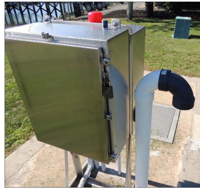
CONTROL PANEL EAST SIDE