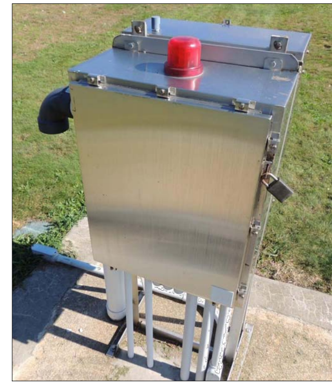
CONTROL PANEL WEST SIDE

REFURBISH ELECTRIC PANELS TO ACHIEVE WATERTIGHT CONDITION AND MAKE PROVISIONS FOR A HEAVY DUTY PROTECTIVE ENCLOSURE BOLTED TO CONCRETE SLAB. (PENDING)